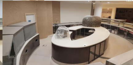
Azerbaijan Fast Food Projects